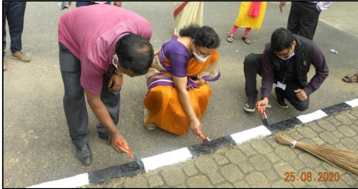
Painting of kerb stones

During the observation of “Swachhata Fortnight”, various activities were carried out by the employees in and around HMT Bhavan like cleaning the surrounding areas, landscaping and lawn formation, disposal of old files & upkeep of the offices, clearing exit ways including disposal of plastic material, painting of Kerb Stones surrounding HMT Bhavan, disposal of E-Waste, planting of saplings by employees, cleaning of vacant premises and basement of HMT Bhavan etc. During this fortnight special emphasis was given to sanitization of the office premises also.