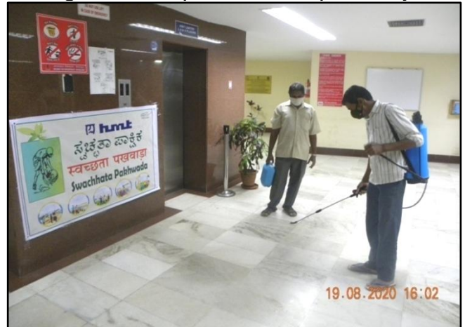
Sanitizing the premises