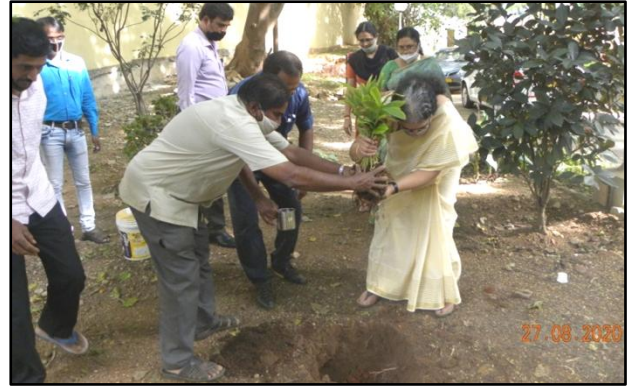
Planting of sapling