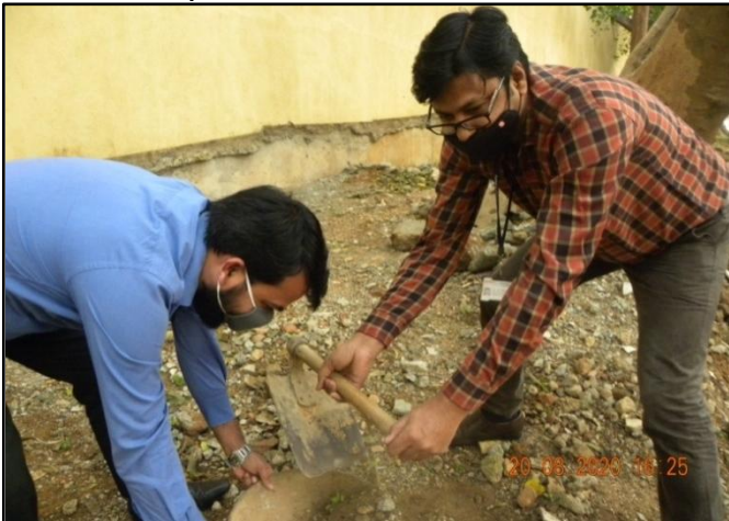
Cleaning the premises